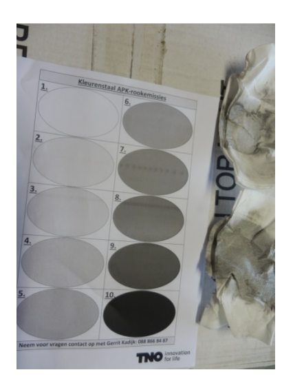
Figure 4: Colour swatch and loaded tissues.