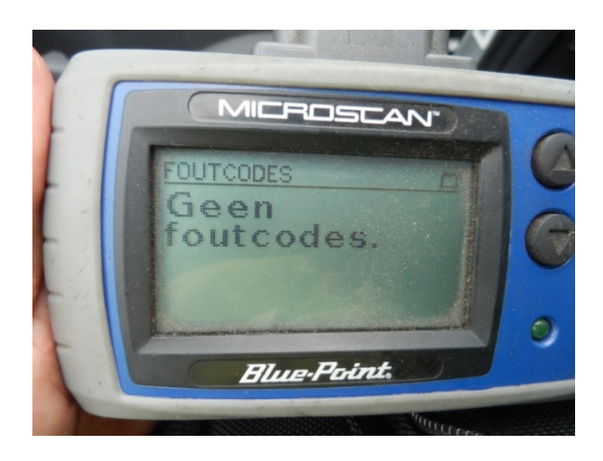
Figure 2: EOBD reader, displaying the message "No error codes".

3. EOBD test: The On Board Diagnostic system of a vehicle monitors some conditions of the DPF. A simple check at the start of the roadworthiness test will gain information about stored failure information. Certain emission-related malfunctions may be stored in the memory of the engine management system and these may indicate DPF failures. Before the start of the EOBD test, the system checks the status of the 'readiness test'. In a readiness test the EOBD system compares a package of predefined speed and load conditions of the engine which are passed in a type approval emission test with the history of the speed and load conditions, the readiness test is passed. If the EOBD test fails, it must be replaced by a smoke emission test using the opacity smoke meter.