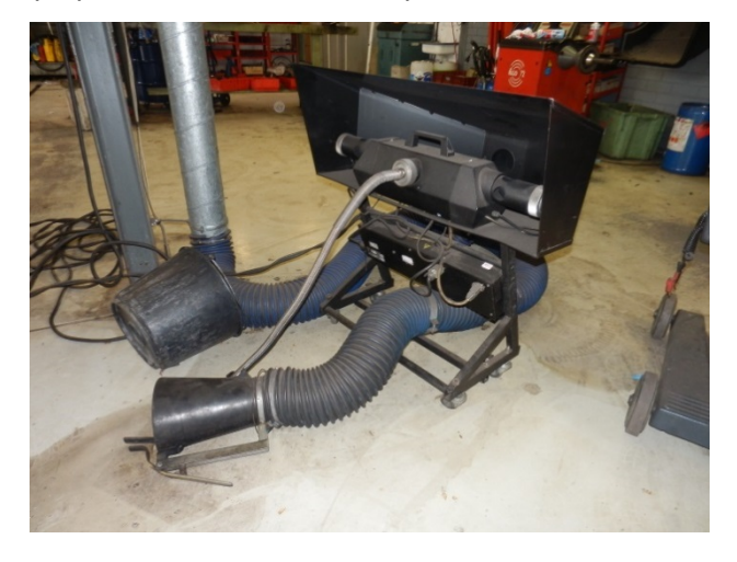
Figure 5: Opacity meter for a roadworthiness test.

5. Smoke emission test with opacity meter: The regular roadworthiness smoke emission test is carried out as a free acceleration test with an opacity meter, shown in Figure 5 and Figure 6. During the test, the engine runs from low-idle to high-idle speed within 1-2 seconds. This generates a smoke peak value. For stabilisation purposes the test must be repeated a few times until the readings are stable.