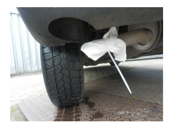
Figure 3: Tissue mounted on a tail pipe for a smoke emission test.

4. Smoke emission test with white tissue: A free acceleration test of an engine starts at low idle speed and moves to high idle speed and back. During the test, the gear box is in the neutral position and the accelerator pedal is moved within 1 second to the maximum positionloading the engine by its own inertia. This yields a raise of the engine speed and, due to a shortage of combustion air, the engine generates a smoke peak. The emitted particulate matter is stored on a tissue which is mounted at the exit of the tail pipe (Figure 3). After the loading of the tissue it can be compared with a colour swatch which ranges from white to black on a 1-10 scale (Figure 4).