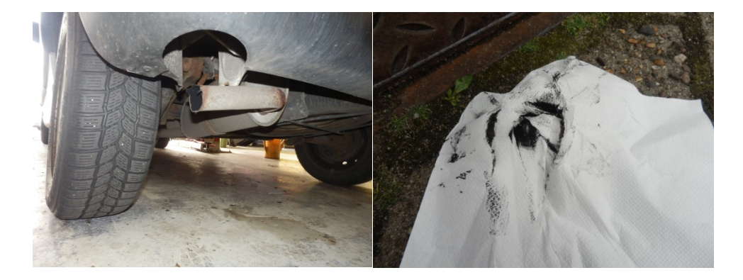
Figure 1: Tailpipe and result of inner tailpipe test

2. Tailpipe wipe test: In this indicative test a white tissue is wiped at the inner tailpipe, as shown in Figure 1. The collected soot on the tissue might be an indication of a DPF failure or removal. However, over a longer period of time very small DPF leaks will pollute the internal exhaust system as well. This means a polluted tissue does not necessarily indicate a malfunctioning DPF, but gives motive for further inspection.