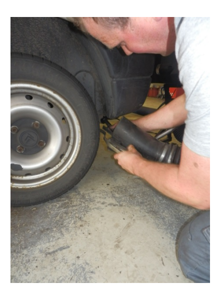
Figure 6: Installation of the sample probe for a smoke roadworthiness test.